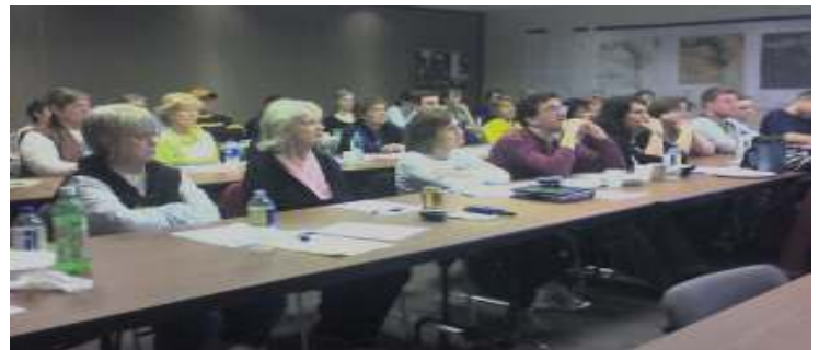
Public Health employees attending Spring All Staff Meeting held at Kent Park Conservation Education Center